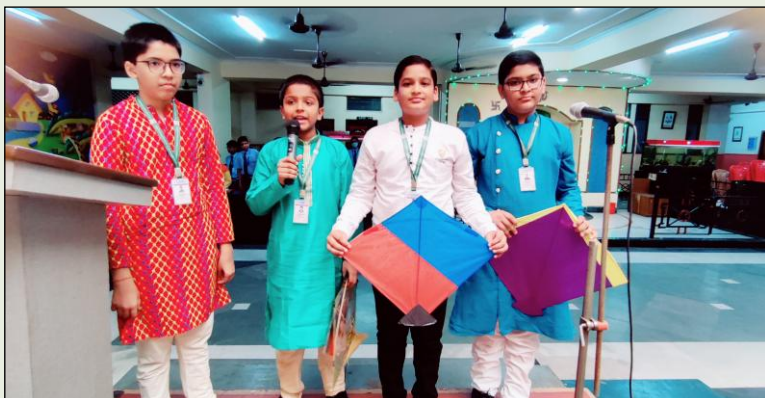
Special assembly on Biswakarma Puja