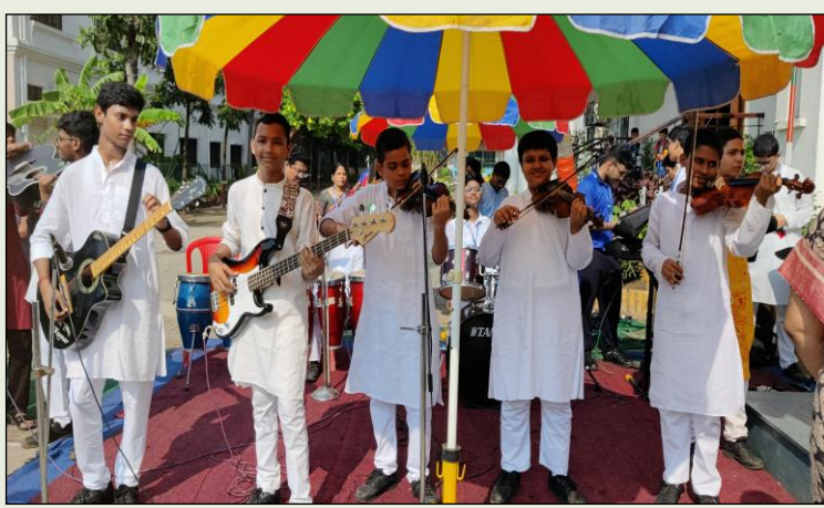
Special Assembly on Durga Puja