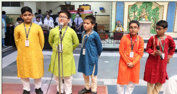
Special assembly on Mahalaya