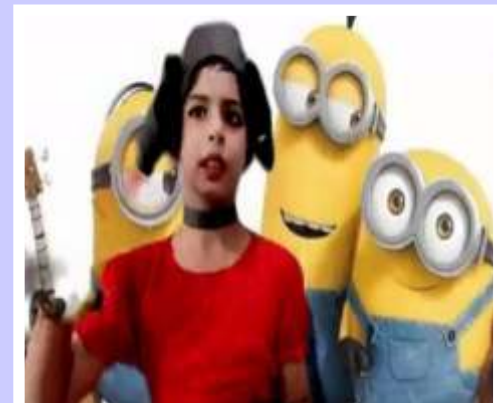
Pantomime, Junior School Role Play Competition