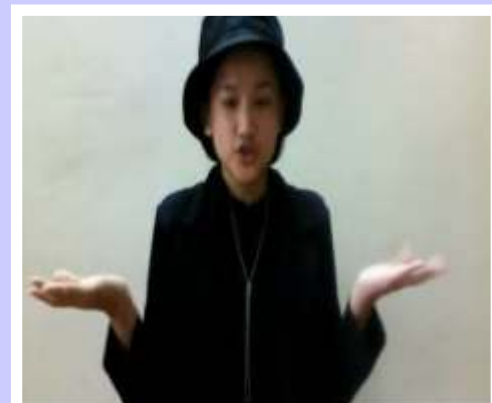
Incognito, Senior School Declamation Competition