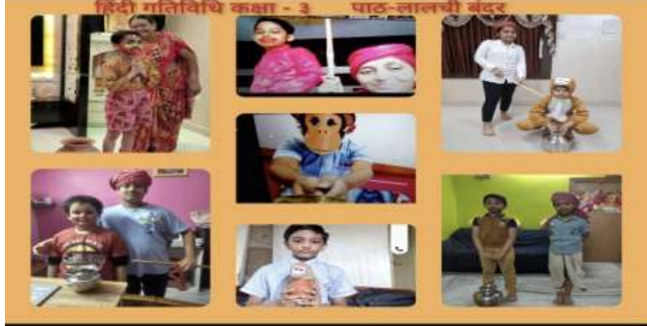
Class -3 Hindi Skit 'Lalchi Bandar'