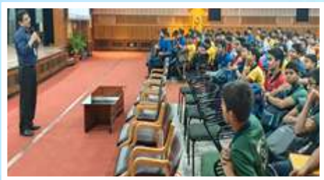
Cyber Awareness Session for Class 9 Students