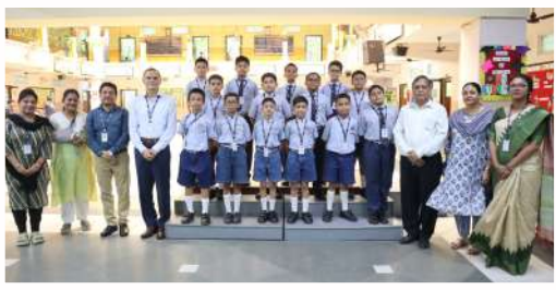
Junior Prefectorial Body Investiture Ceremony