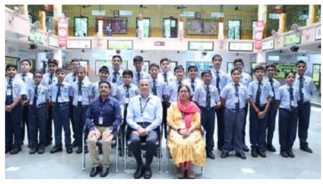
Monitor Investiture Ceremony: Recognising Young Leadership in Action