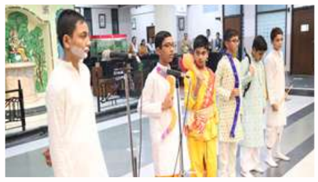
A Morning of Gratitude: Students Celebrate Guru Purnima