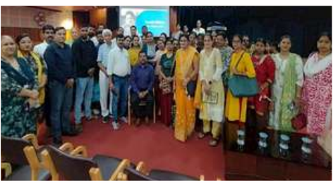
Sweet Choices, Healthy Lives! In a proactive move to promote student well-being, M. C. Kejriwal Vidyapeeth launched a comprehensive Sugar Awareness Campaign aimed at reducing excessive sugar consumption.