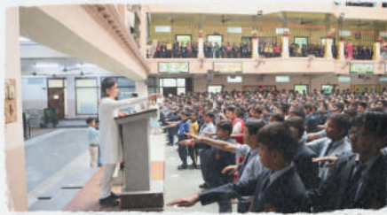
MCKV commemorated the 75th anniversary of the adoption of the Constitution of India