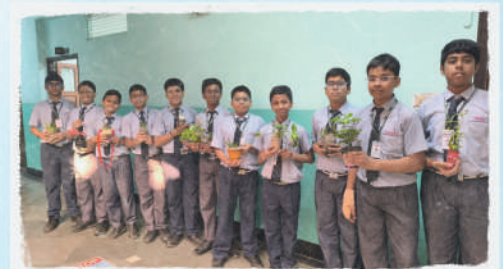
Plantation Activity: The Social Service Group and Interact Club of M.C. Kejriwal Vidyapeeth launched a Plantation Project to educate the students about the procedure and the benefits of planting a sapling.