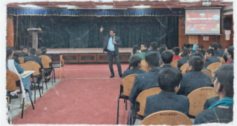
The Influence of Peers and Friends: An Interactive Session for the students of Class 7