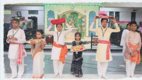
Celebrating Chhat Puja, one of India's most significant Hindu festivals