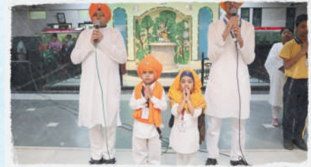
Celebrating Guru Nanak Jayanti