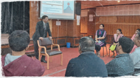
Building Resilience and Grit for Academic Success – A session with the parents of Class 11