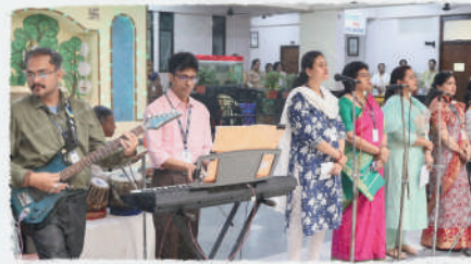
Children's Day Celebration