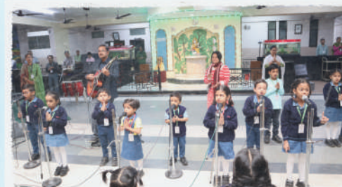
Pre-Nursery to Kindergarten presented an assembly on Thanksgiving Day

For detailed reports and photographs of the above events, please visit our website www.mckv.edu.in