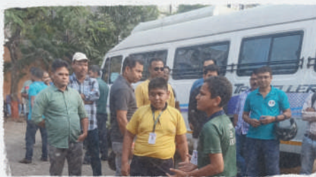
Street Act: On 26 November 2024, Interact Club of MCKV organised a powerful and thought-provoking street act aimed at raising awareness about road safety.