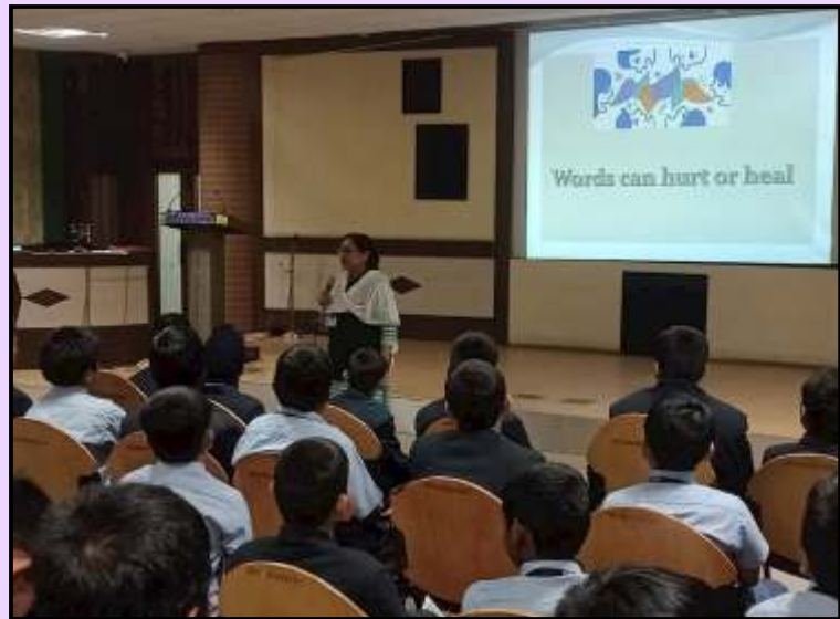
Words Can Heal or Hurt: An interactive session by our School Counsellors for the students of Class 5

For detailed reports and photographs of the above events, please visit our website, www.mckv.edu.in